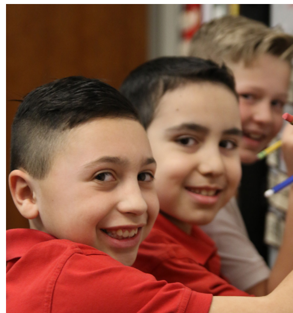
After School Spanish Grades 4-6