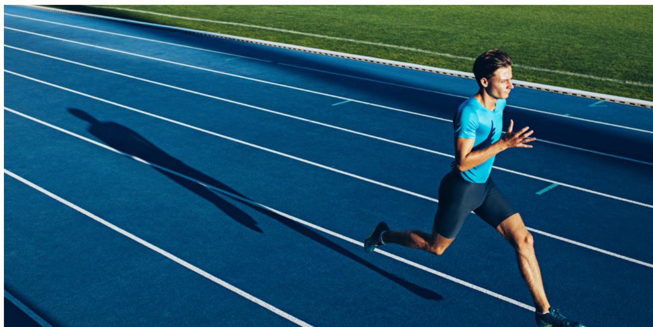
TRACK & FIELD