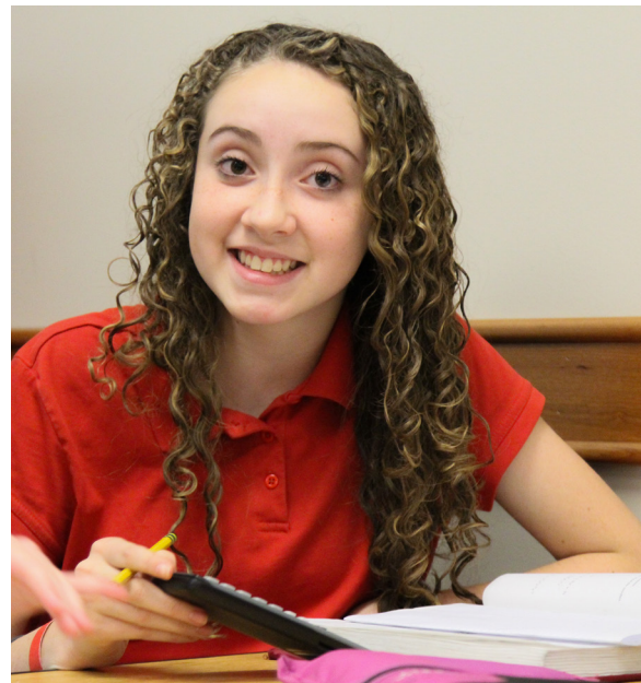
Introduction to Statistics