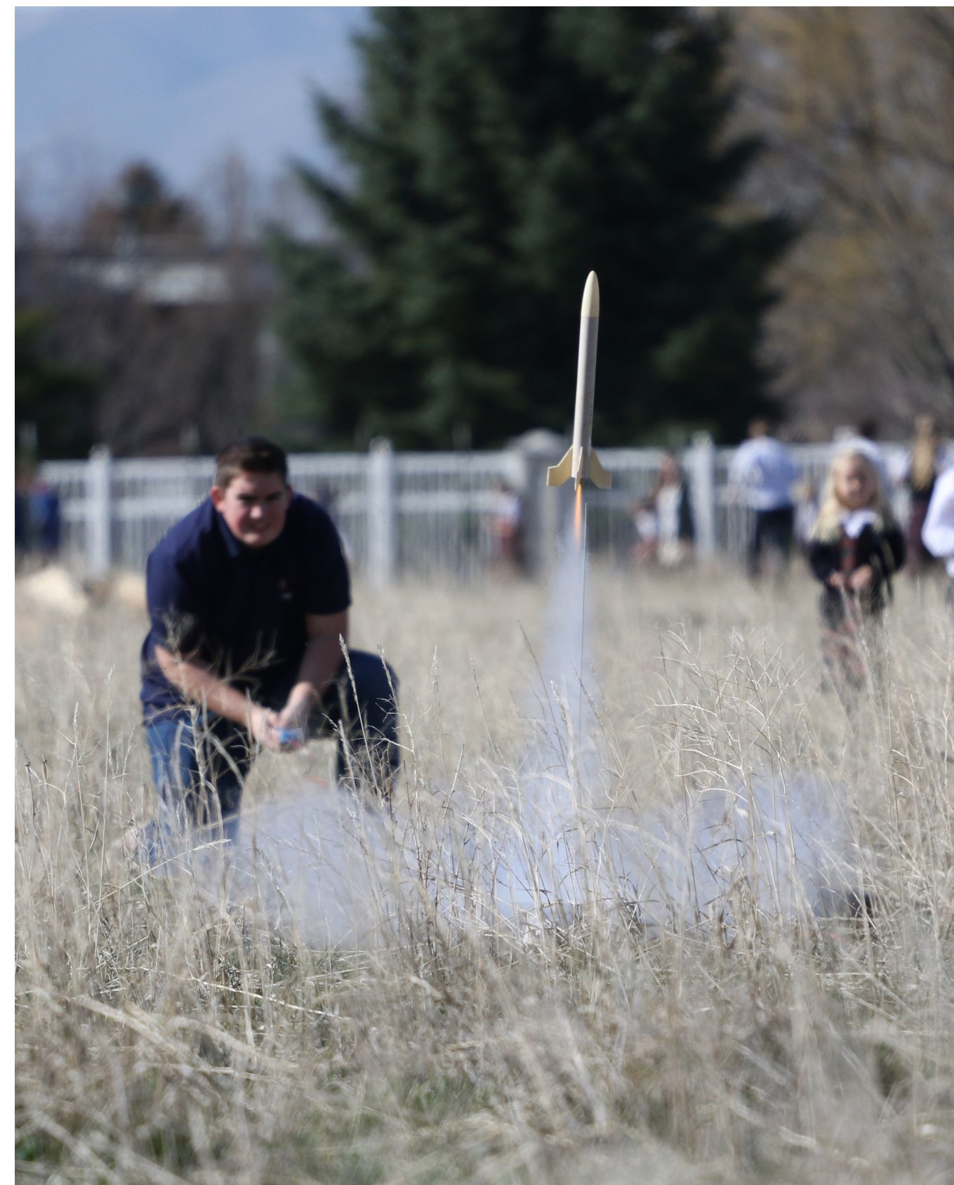
Introduction to Engineering