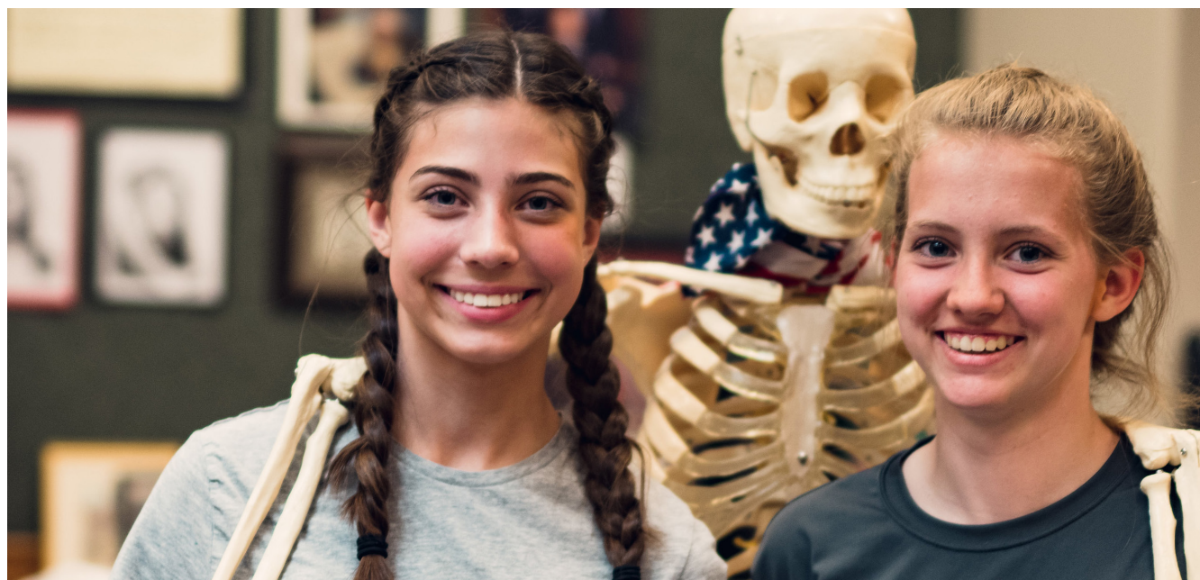
Medical Anatomy & Physiology