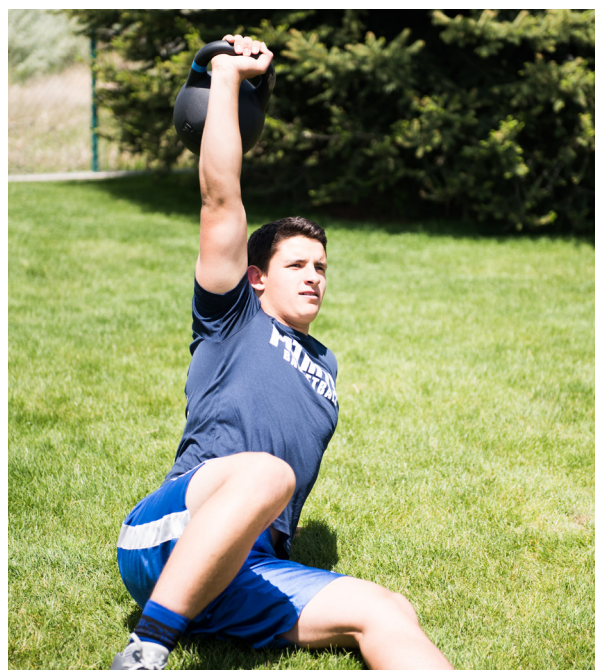
STRENGTH & CONDITIONING